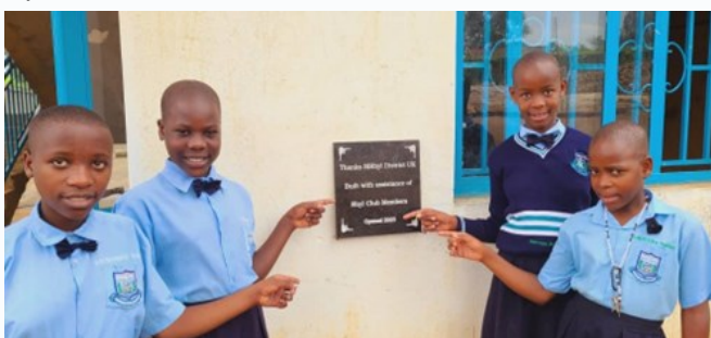
The plaque reads: Thanks SI Rhyl & District UK. Built with assistance of Rhyl Club Members Opened 2023

We have finally completed our long term project to help build a dormitory in Masaka, Uganda to enable girls to receive an education at the local school. Over 7yrs we have raised £10,506.50 towards this venture.