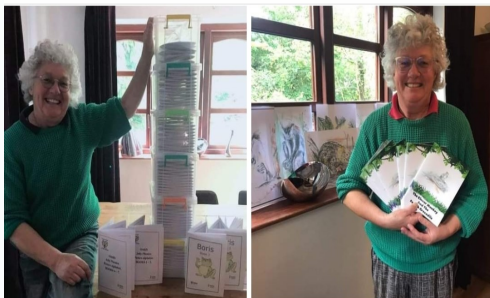
Phonic books, Boris the Bullfrog & The Clever Monkey and the Foolish Crocodile